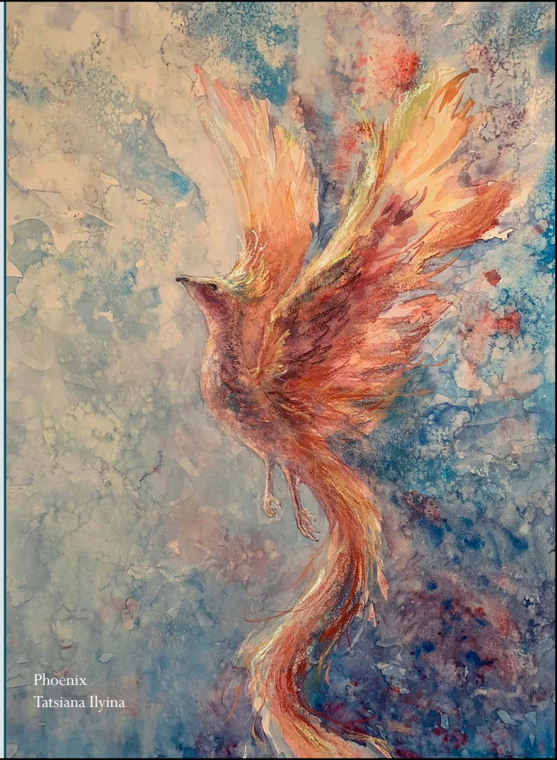
Phoenix Tatsiana Ilyina